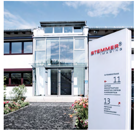
Headquarters in Puchheim