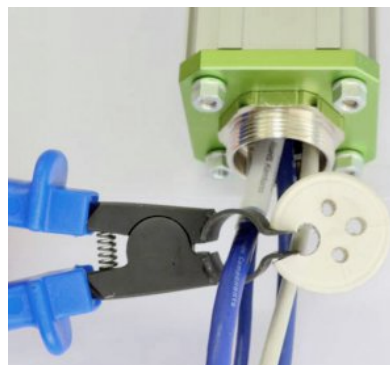
The Spreading Pliers are helpful to insert cables into the cable gland insert