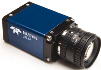
Genie HM1400 / XDR