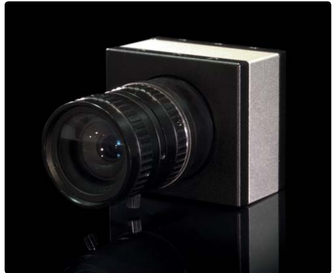
Photo similar to original product

Parallel operation of multiple cameras possible