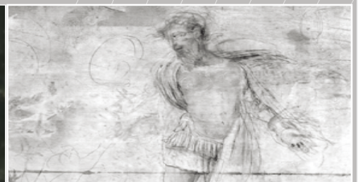
• Art inspection