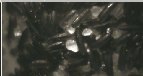
• Food inspection