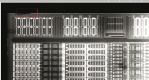
• Semiconductor inspection