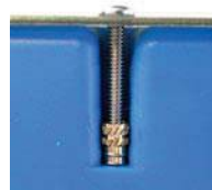
Figure 4. Correctly installed insert & screw