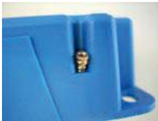
Figure 1. Insert at bottom of slot ready to be pushed in

Heating the insert with a heat gun will help with less force and an easier install. If heating is used, heat the insert. DO NOT heat plastic housing on the light.