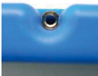
Figure 3. Correctly installed insert

Use 6 inserts/screws for a Linear light and 3 inserts/screws for a Brick light. Snug down screws to diffuser or polarizer. Over tightening screws can break diffuser/polarizer or inserts will begin to pull toward surface. Do not over tighten with excessive force. For added stability on a permanent installation, a thread locking compound may be used on the screw.