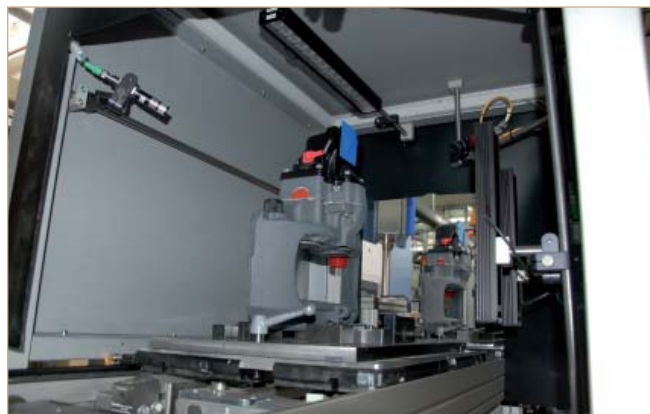
Three cameras, different illumination units and two line lasers are in use in the test cabin.