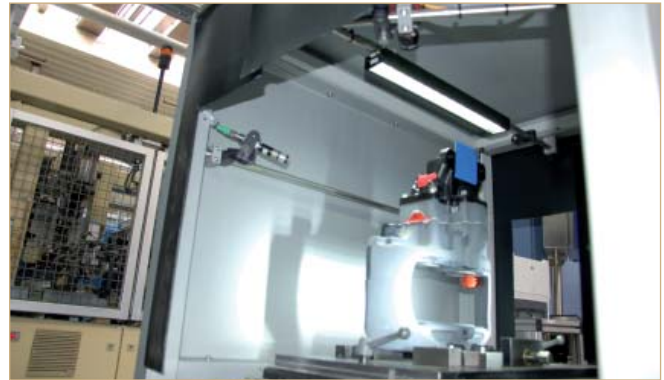
Illuminated brake in the test cabin

But first of all, the corresponding data from the disc brake production must be collected in the test cabin. This is ensured by three AVT cameras equipped with Schneider lenses and two line lasers by Z-Laser in combination with the Sherlock image processing software of Teledyne DALSA. Finally, a Neupro Solutions-Sherlock plugin for Oracle transfers the data to the data base. "The individual check algorithms are global and are recalled via the data base using the part number. In addition, it is possible to statistically evaluate the measurement data stored in the data base and to perform a statistical approximation within the predefined threshold values", reports Mr. Progl.