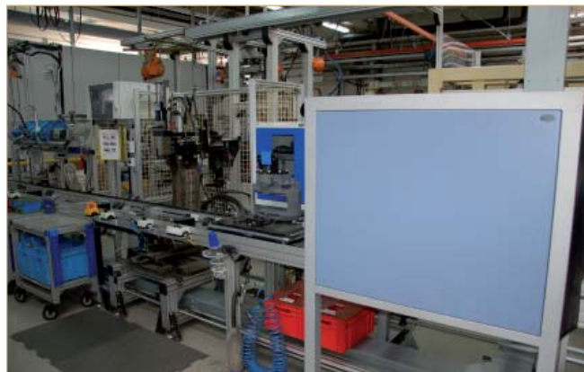
At Knorr-Bremse, 1,200 disc brake types with 64 different characteristics are 100% inspected by an image processing system. A conveyor system transports the brakes mounted on workpiece carriers to the work area of the test cabin.

And it was precisely this variety that brought about the specific requirement for this project. In addition, the time frame for the realisation of the project was very tight. Knorr-Bremse has been using image processing systems in another sector in Aldersbach since 2004. Based on the experience gained in the use of image processing systems and increased requirements, Mr. Bauer was looking for a new, holistic hardware-independent and upwards-expandable image processing system. Furthermore, the possibility to implement existing own applications or software algorithms was also required.