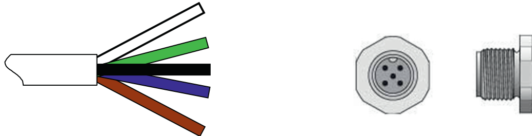
Standard M12 5 Pin cable with Euro color code