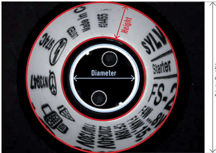
c (%) = Diameter/Detector Short Side